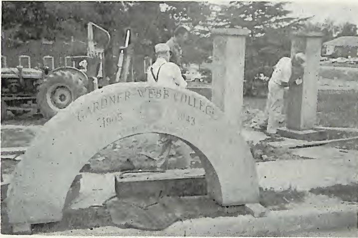
Workmen Are Shown Erecting Arch On New Location

(Editor's Note—A former Gardner-Webb student remembers the campus as it was before the arch was removed from its former location to a site in front of the administration building. The arch and the walk to it became a symbol of life to the student who describes her feelings about days at the college.)